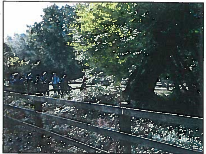
The ECTF meet the "Caged Pollard" at Burnham Beeches