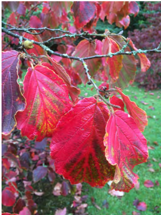
Hamamelis mollis 'Goldcrest'

When the temperature plummets and the first frosts appear, this process accelerates, until finally the leaves start to drop and the trees prepare themselves for winter and dormancy.