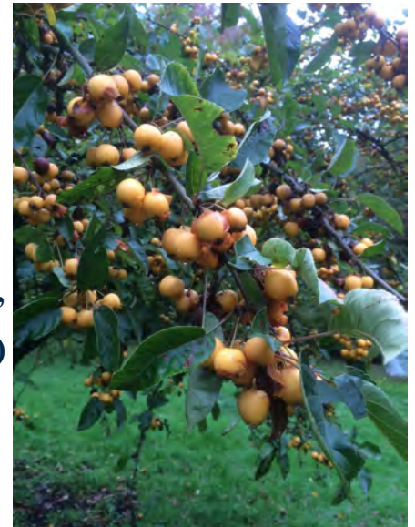
Malus 'golden hornet' (crab apple)