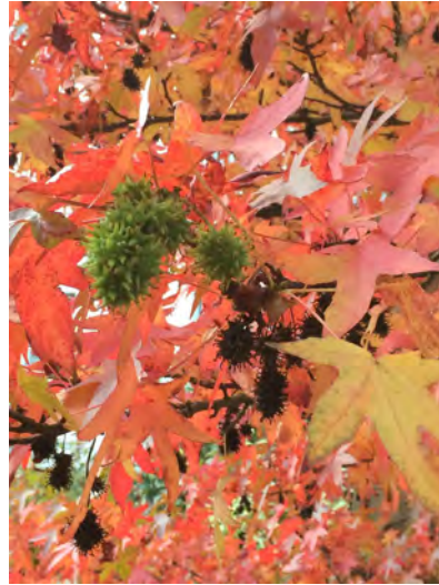
Spiked seed pods of Liquidambar

The oak Quercus suber (cork oak) has thick corky bark which is used for wine corks.