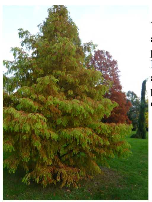
Metasequoia glyptostroboides 'Matthaei Broom'

You should not depart until you have spent some time admiring the truly splendid eye catching display performed by the Metasequoia glyptostroboides 'Matthaei Broom' and Ginkgo . All trees fairly close together make