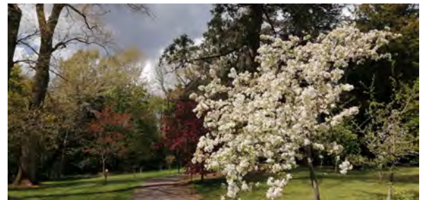
Crab apple (malus)