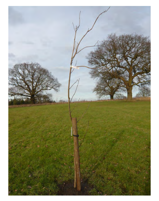
Cladrastis kentukea, Prunus dulcis, Corylus maxima [pic right] Metrosidoros umbellata

Catalpa x erubescens 'Purpurea' Catalpa speciosa [pic left] Catalpa speciosa 'Pulverulenta'