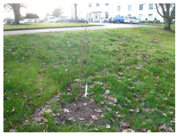
Catalpa fargesii Catalpa ovata x 2 Catalpa fargesii duclouxii Catalpa bignonioides 'Aurea'

Ulmus procera, Ulmus minor, Ulmus x hollandica 'Vegeta'