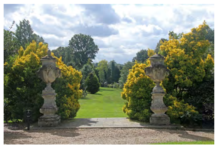
This lovely Euonymus was getting too large and has been taken out - an example of tough decisions that have to be made.