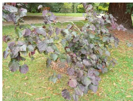
Cercis Canadensis Eastern Redbud