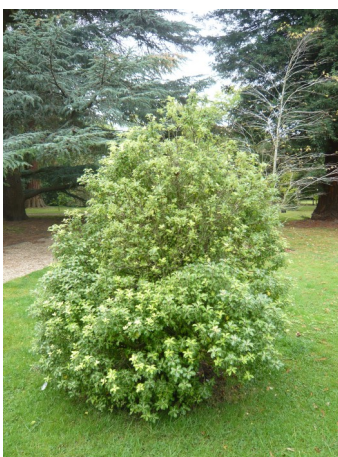
Pittosporum tenuifolium 'Goldstar' Kohuhu tree