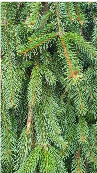
Picea abies 'Inversa'

A visit to the Beale Arboretum is rewarding at any time of the year and Winter has its own glories on show for all. Be it the varied tree barks often covered in green lichen, or the last of the autumn berries on the trees, there is always something for everyone. In this season, the views across the arboretum open up, showing the shapes and forms of the tree branches whilst emphasising the vistas through the landscape. Certainly, the conifers come into their own when all the deciduous trees have lost their leaves and featured below are a selection with one particular characteristic: pendulous branches.