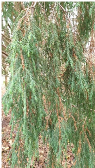
Juniperus recurva 'Castlewellan'