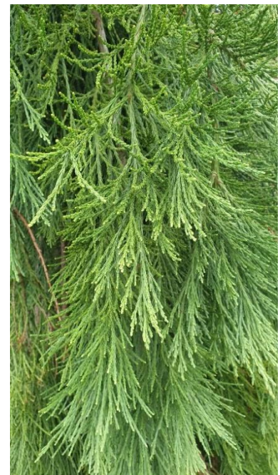
Sequoiadendron giganteum 'Pendulum'